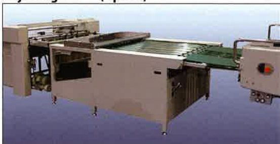
Rejecting device (Option)

Inspected sheets are sorted by Rejecter conveyor.